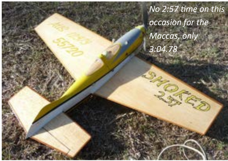
No 2:57 time on this occasion for the Maccas, only 3:04.78