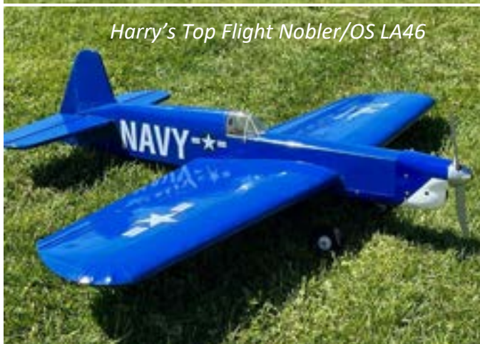
Harry's Top Flight Nobler/OS LA46