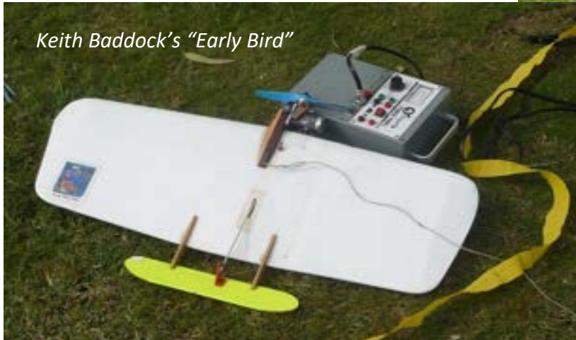
Report and pictures by the Editor.