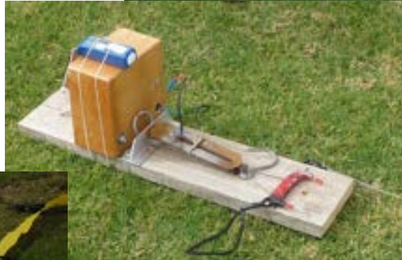
The new line pull tester was used for the first time.