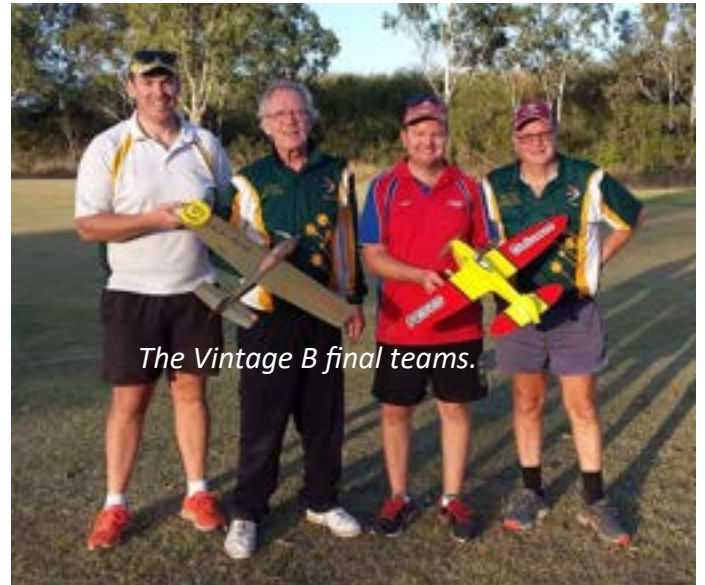
The Vintage B final teams.

The Simple Rat race was flown using the local rules which permitted whipping.