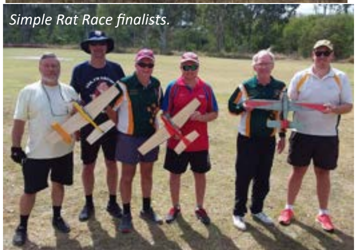
Simple Rat Race finalists.

The final race had the two Nelson powered models battling for supremacy and Justic/Owen just managed to edge out McDermott/